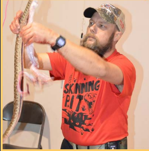
Soon to be fried Rattle Snake!