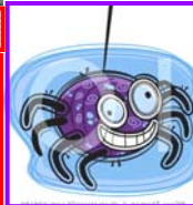
Bedtime Stories ~ The Myth Book says ; "The average person swallows four spiders in their sleep a year!" TRUE OR FALSE?