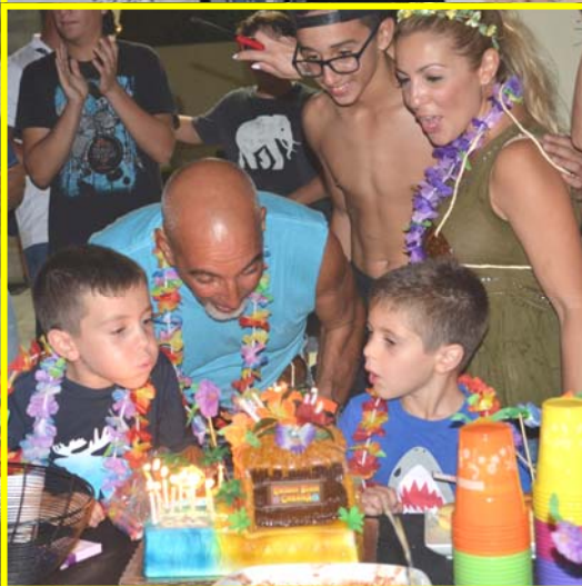
<<Happy Birthday Poppy! We have Great neighbors!