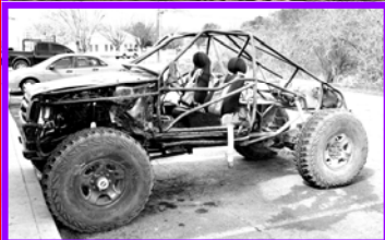
It was JEEP Week, as we passed through MOAB, UT!! It was crowded with off road