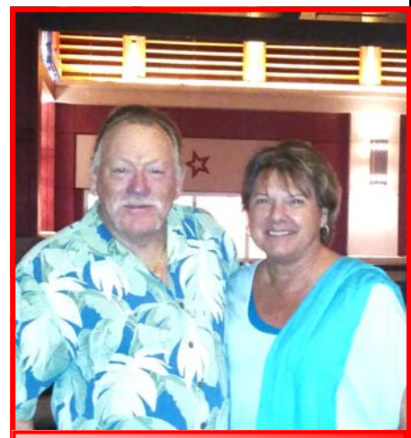
Jan. 31st, Our 34th Anniversary Date Night!