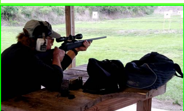
Sighting in New Rem 783 cal .308 ~ 3 inch groups @ 100 yards!