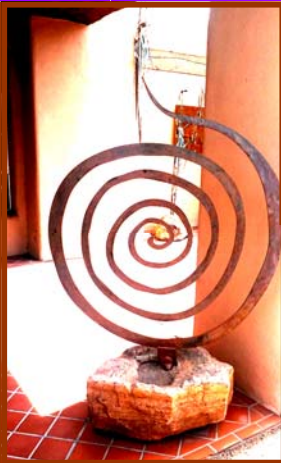
On the way home from Utah, we stopped in Santa Fe, NM.