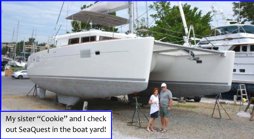
My sister "Cookie" and I check out SeaQuest in the boat yard!