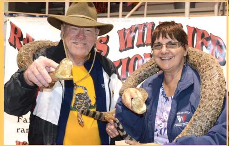
Everything Rattle Snakes even stuffed ones!