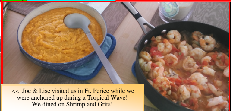
<< Joe & Lise visited us in Ft. Perce while we were anchored up during a Tropical Wave! We dined on Shrimp and Grits!