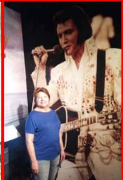
After New Mexico, we stopped at the Peabody Hotel in Memphis, TN to see the DUCKS! The next morning we went to Graceland, home of Elvis Presley!!