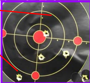
Bountiful, UT ~ Shooting at 600 yard is not easy! I didn't even hit the Black after 12 shots! 200 yards was much easier. At least I hit the center of the 8 inch target.