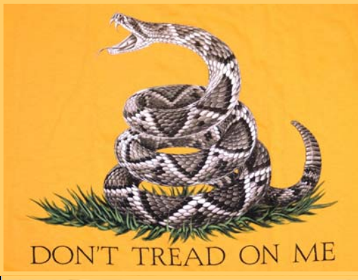
The Rattle Snake Round up! Sweet-water, TX